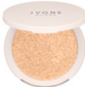
02 18K 86801