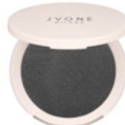
09 BLACK 86808