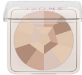
02 TONE ENHANCER 85851