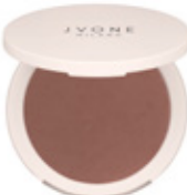
07 WARM BROWN 86806