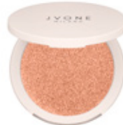
03 AMBER 86802