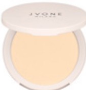
04 BUTTER 86803