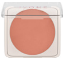
03 SALMON 85856