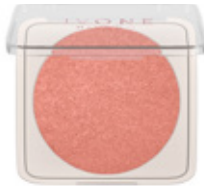
03 PINKY 85861