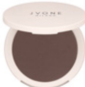
08 COLD BROWN 86807