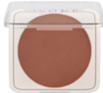
02 TEDDY 85855