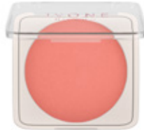
01 PEACH 85854