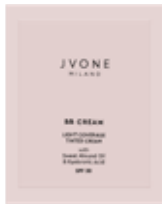
SACHET of BB CREAM 89993

With SWEET ALMOND OIL AND HYALURONIC ACID SPF 30. Elevato potere idratante.