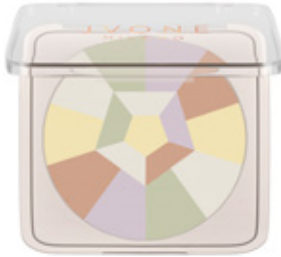
01 CORRECTIVE UNDERTONE 85850