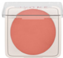
04 NUDE 85857