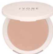
05 NUDE ROSE 86804