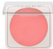
05 LIGHT MAUVE 85858