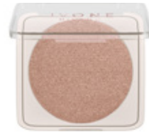
05 BRONZER 85863