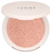
01 GOLD ROSE 86800

wet effect and perfect fit, ideal to create highlights