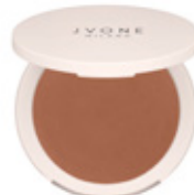
06 RUST 86805