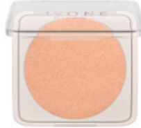
01 GOLDEN HOUR 85859