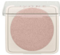
04 MAUVNESS 85862