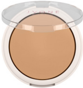
01 MEDIUM 85852