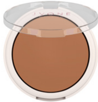
02 TAN 85853