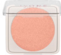
02 PEACHY 85860